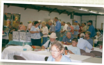
Buffet lunch in the packing house.

T he staff enjoyed putting faces with names and visiting with customers. We want to thank all of the vendors that attended, and all of our customers who helped make the event a great success!