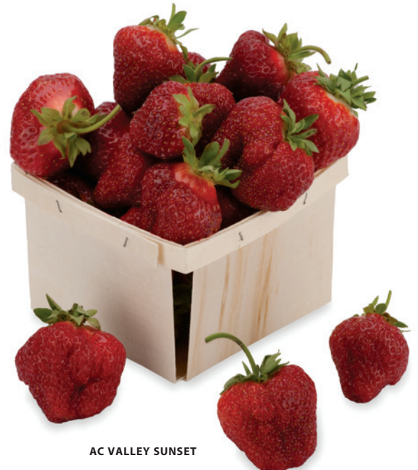
AC VALLEY SUNSET

While I state these differences, growers responding to Grower Surveys for each of the varieties, rated them similarly in flavor and over-all performance. With the high demand for late varieties, we highly recommend you order early to be sure of your supply.