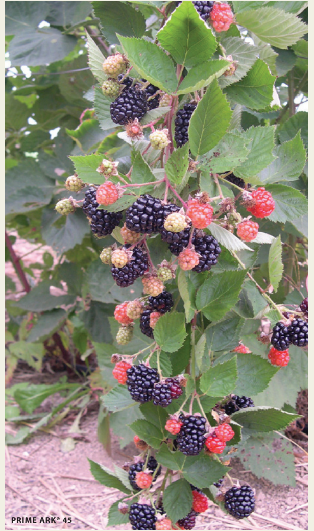
PRIME ARK® 45