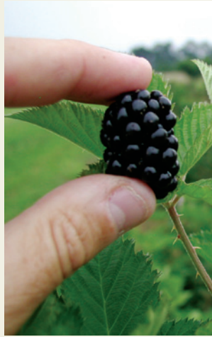
PRIME ARK® 45

Prime Ark® 45 U.S. Plant Patent Pending Recently introduced, Prime Ark® 45 is quickly being recognized to be a high performing primocane blackberry. It is not thornless, but the spines are modest compared to other thorny varieties. As Prime Ark® 45 ripens later in the season than either Prime Jim or Prime Jan, it is not adapted to northerly areas, but is an excellent candidate for tunnel production. We have publicized the proper tipping procedure for both Prime Jim and Prime Jan. Prime Ark® 45 also needs to be tipped, but the timing and the procedure is different to achieve the best performance. The very large sized berries and great blackberry taste make Prime Ark® 45 a great performer.