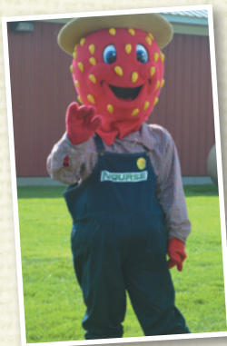
Mr. Strawberry was on hand to greet everyone!

T he staff enjoyed putting faces with names and visiting with customers. We want to thank all of the vendors that attended, and all of our customers who helped make the event a great success!